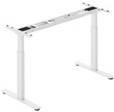
Height Adjustable Frame -2 Stage Dual Motor