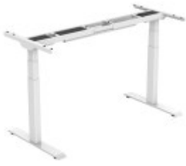
Height Adjustable Frame -3 Stage Dual Motor