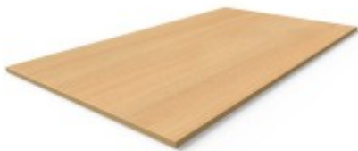
Melamine Table top