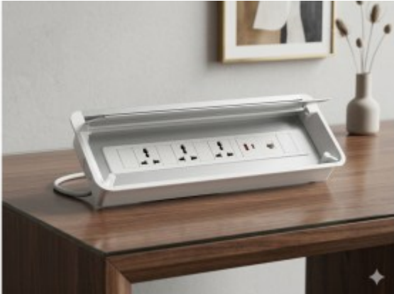
PDU - FLIP COVER