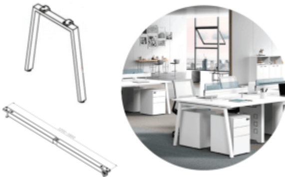
Metal Frame - Slant Type