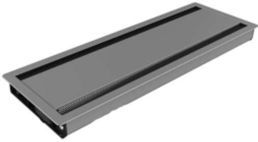
Dual Open Conference Cable Cover - DFW / DFB