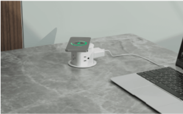
POP UP Series PDU