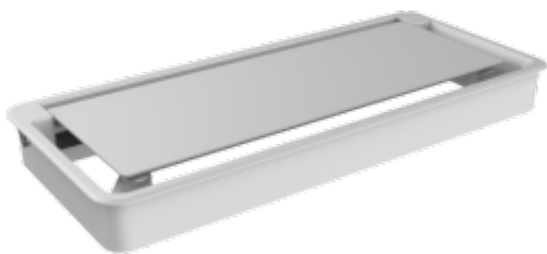
Flip Cover Series