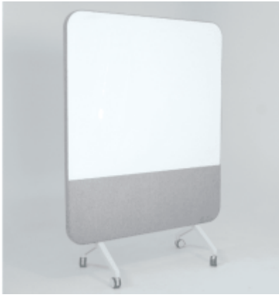
Movable Partition Screen