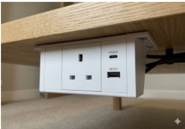
Under Desk PDU