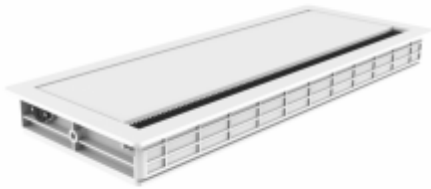
Flip Cover Series - FW / FB