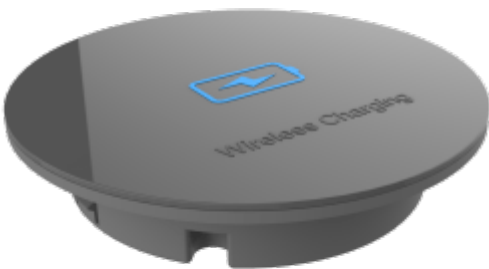
Wireless Charger - WCW