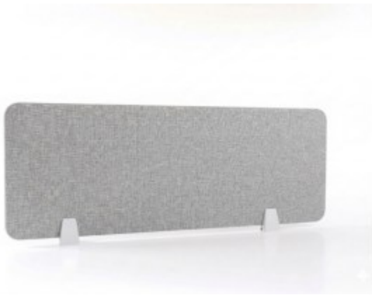
Fabric Partition Screen