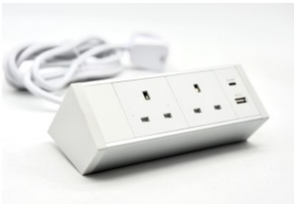
Power Data Unit - Clamp Mount