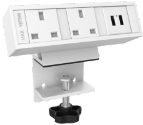
Leisure Series 3 Socket