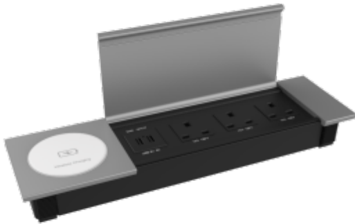
Integrated Series Socket