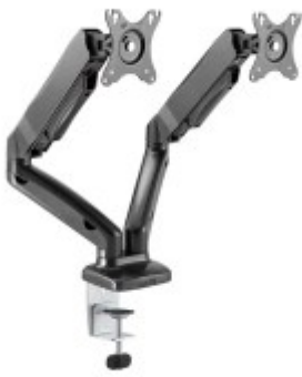
Dual Screen Monitor Arm