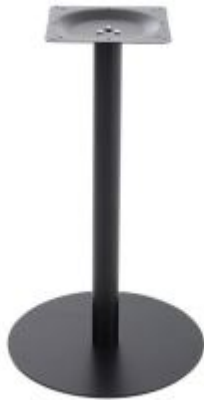
Round Table Metal Base