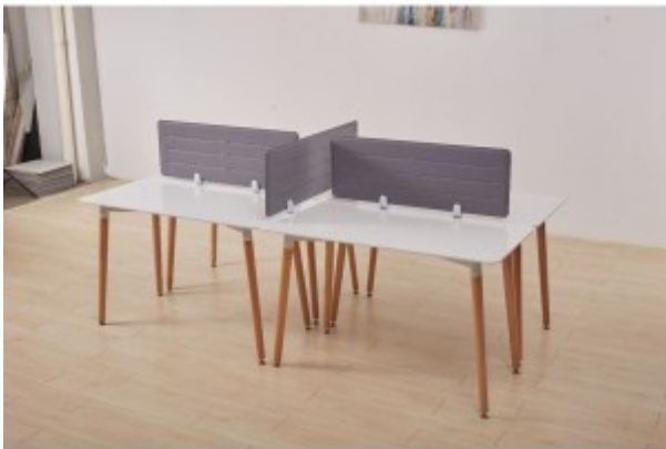
Acoustic Partition Screen