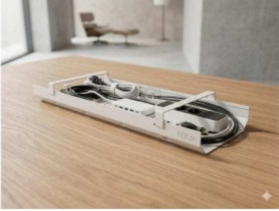
Cable Tray - CTW / CTB