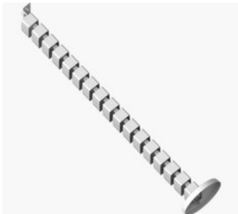
Wire Skeleton - CRW / CRB