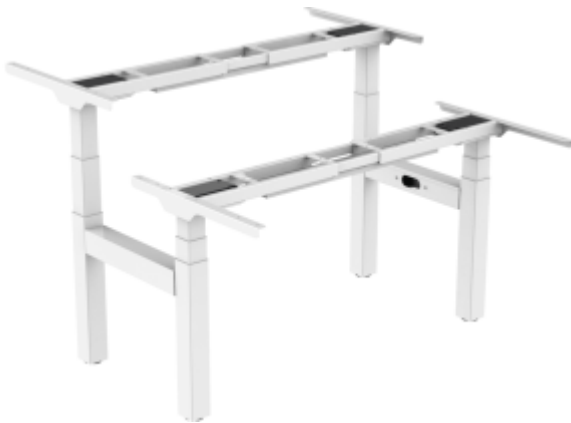
Dual Benching Height Adjustable Frame Only - DHADW / DHADB